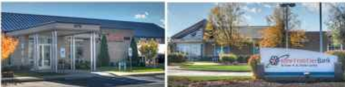
3773 Elm Street • St. Charles

We do things a little differently. Come see for yourself.