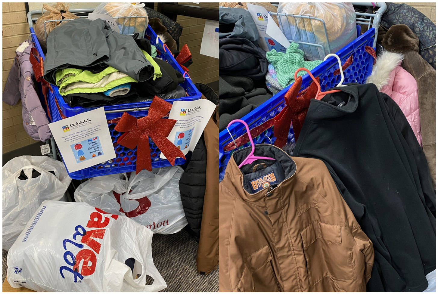
Coats donated to help families in the St. Charles area stay warm through the ministry of Oasis Food Pantry. Thank you!