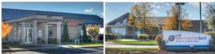
3773 Elm Street • St. Charles

We do things a little differently. Come see for yourself.