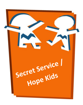
Hope Kids & Parents Prek-5<sup>th</sup> grade Lunch & a Service Project Sunday, April 13 after second service in the gym, @11:45 am. We will do something to thank Hope staff members.

Vacation Bible School with Friedens UCC @Friedens Monday, 7/14-7/17 Dinner at 5:30 pm Songs, Games, Crafts, Science, Bible story, 6 pm-8 pm! It's Free! And the theme is Road Trip: On the Go with God!