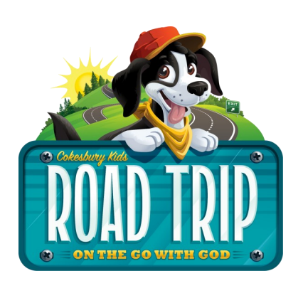
Save the Dates!

Vacation Bible School with Friedens UCC @Friedens Monday, 7/14-7/17 Dinner at 5:30 pm Songs, Games, Crafts, Science, Bible story, 6 pm-8 pm! It's Free! And the theme is Road Trip: On the Go with God!