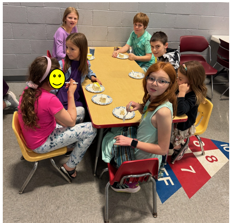
Everyone enjoyed a piece of cake after confirmation.